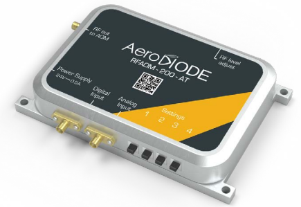
RF driver : Special version able to combine digital (TTL) and analog inputs.