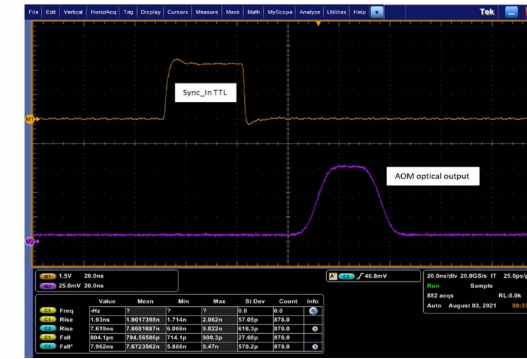
20 ns output optical pulse shape (high speed AOM version).