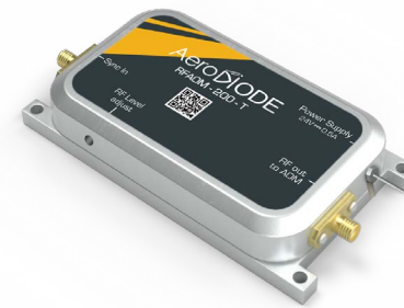
RF Driver - std version (TTL or analog).